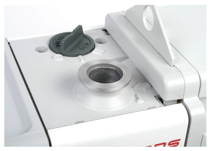
Gas Ballast control on RV oil sealed rotary vane pump

This will prevent water vapour condensing inside the relatively cool pump. "Blanking" the inlet of the pump, by closing a valve, and allowing the pump to run pumping "nothing" is all that is required. Running gas ballast during this process will help the pump warm up faster.